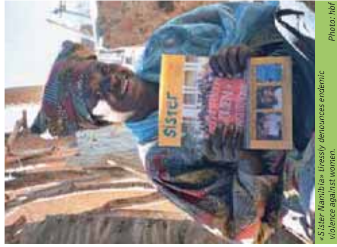
«Sister Namibia» tirelessly denounces endemic violence against women.