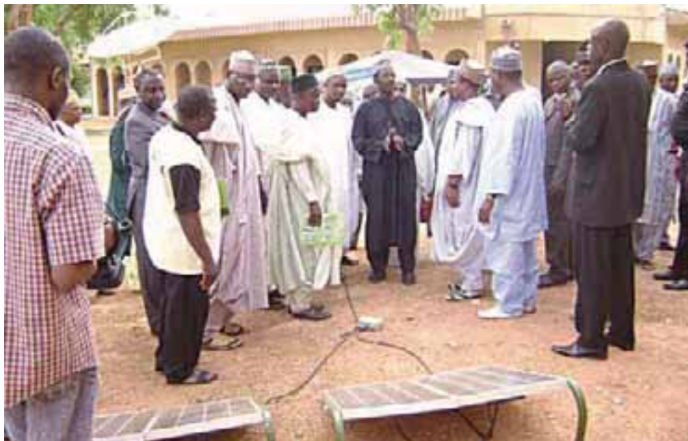
Training workshop about the causes and effects of climate change in Nigeria.