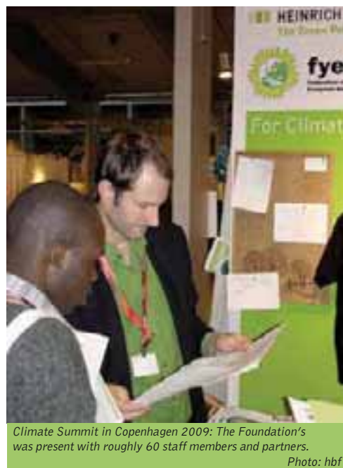
Climate Summit in Copenhagen 2009: The Foundation's was present with roughly 60 staff members and partners.

Publications on the Green New Deal: www.boell.de/publications