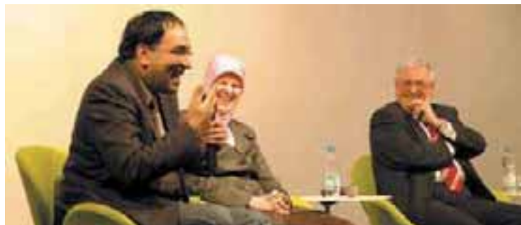
The Foundation: A platform for discussions