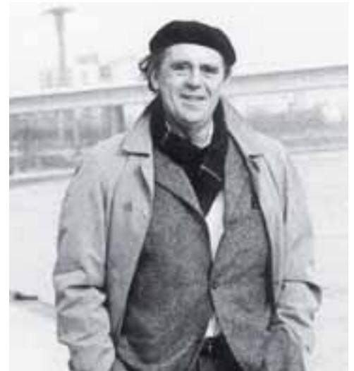
Our namesake is the writer and Nobel Prize winner Heinrich Böll, who personifies the principles to which we are committed: the defense of freedom, civic courage, militant tolerance, and the value of art and culture as independent spheres of thought and action.

Heinrich Böll Foundation Schumannstr.8 D-10117 Berlin P +49 (0)30.285 34-0 F +49(0)30.285 34-109 E info@boell.de Current downloads and dossiers at www.boell.de